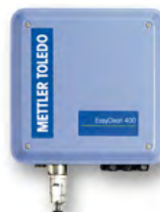
automatic pH measurement, cleaning and calibration system EasyClean 400.