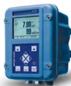
pH transmitter M 700.