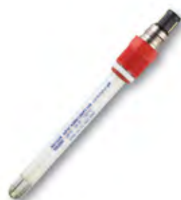
pH electrode InPro 4260.

Subject to technical changes. © Mettler-Toledo AG 06/07 Printed in Switzerland.