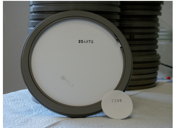
The filter elements are given identification numbers and inserted in standard frames.

„This sensitive weighing process requires maximum accuracy and repeatability for balance and method.“