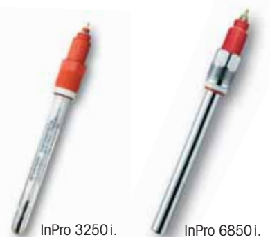
InPro 3250 i.