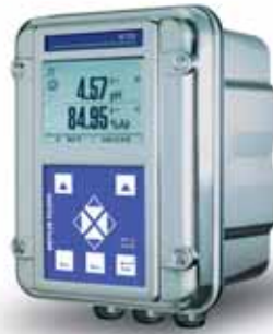
M 700 transmitter.