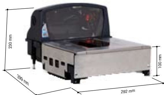
Stratos N Dimensions - 2400 Series