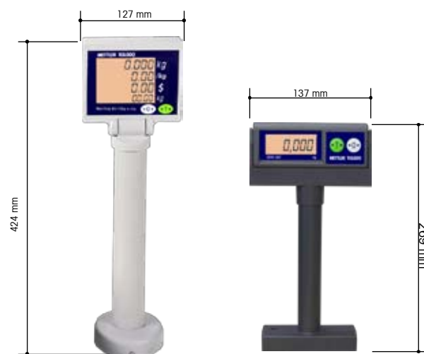
Price Computing Display