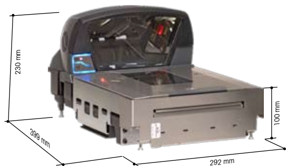
Stratos S Dimensions - 2200 Series