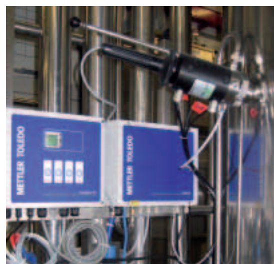
Cleaning system EC 350e and the InTrac 777e retractable housing.