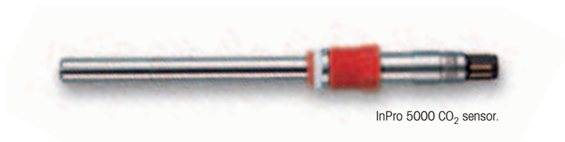
InPro 5000 CO 2 sensor.